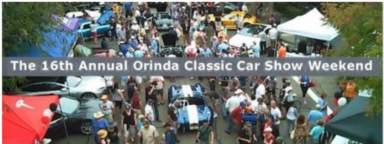
The 16th Annual Orinda Classic Car Show Weekend

Participant Online Entries Are Open for the 2020 Tour.