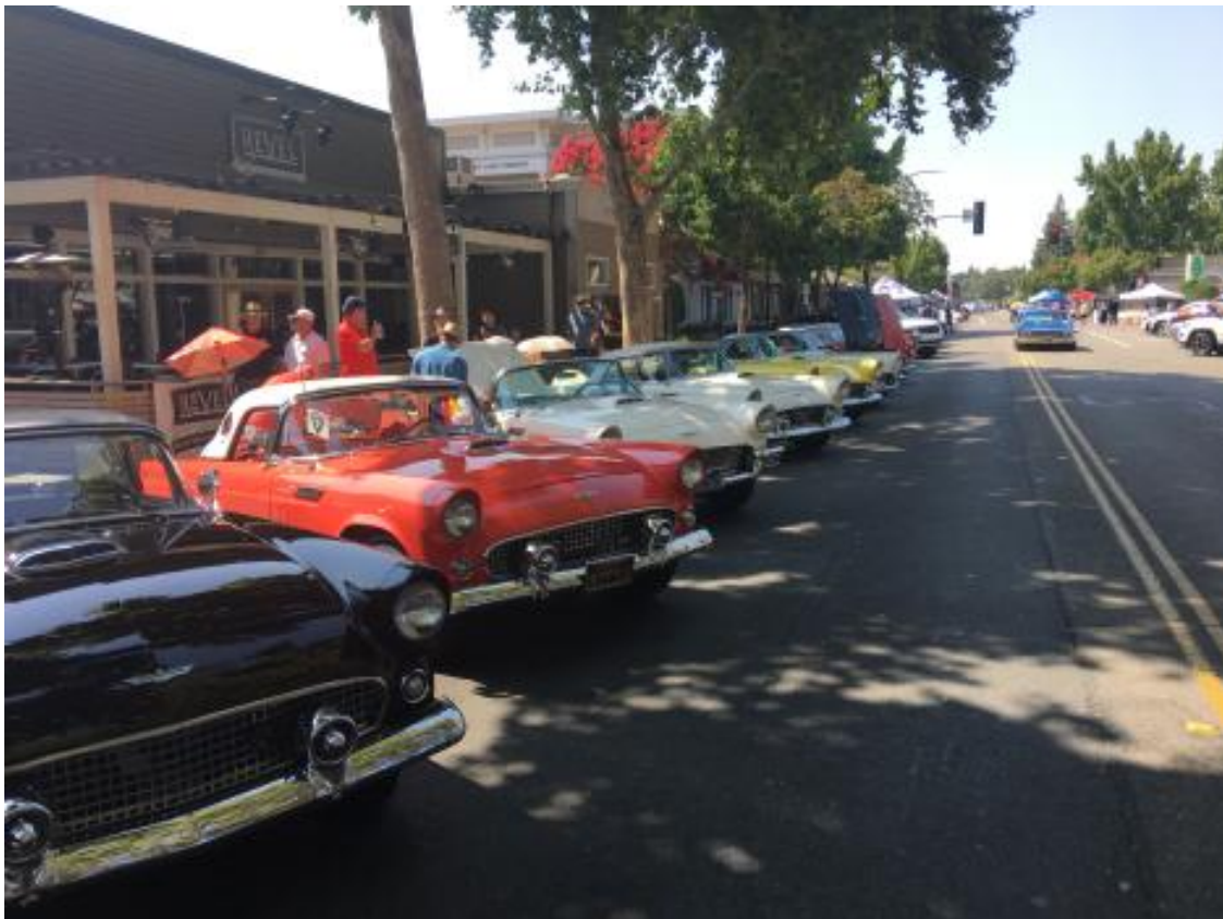
Danville Hot Danville Nights 2017

Well, we can't have a normal gathering, but perhaps we can each go out and drive our cars around for everyone to see and enjoy them. Hopefully, next year will be a different situation.