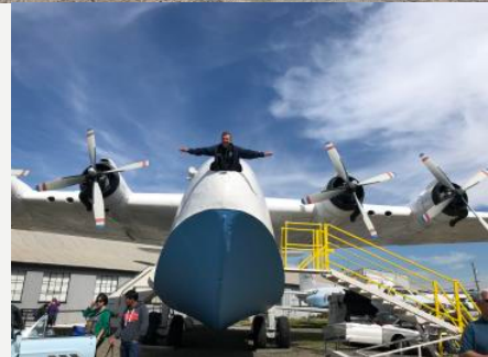
Guy on the Flying Boat