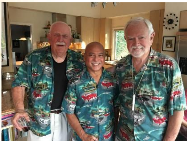
The Three Amigos