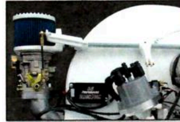
Installs virtually anywhere, from under the dash, to on the Engine.