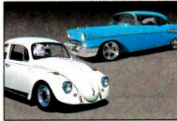
Works on 4, 5, and 8 Cylinder Applications.