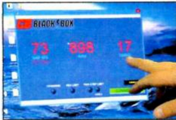
Connects to your Window Laptop via included Serial Cable.