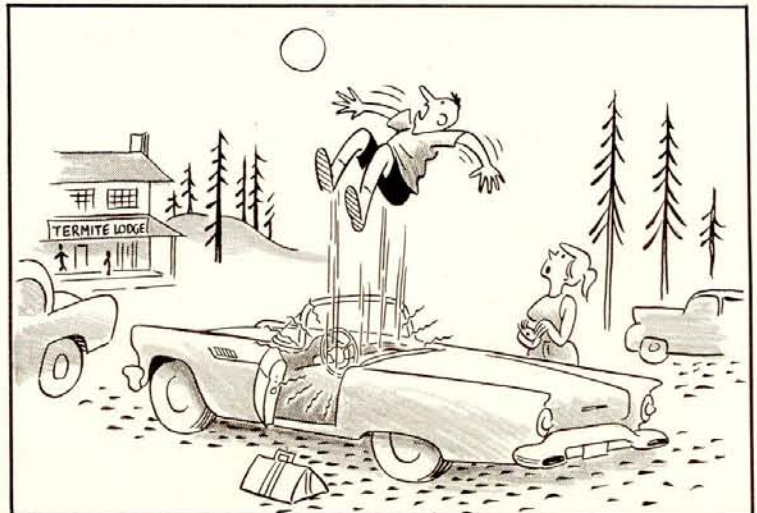
"PUT THE TONNEAU COVER ON . . . THOSE WERE MY VERY WORDS!"

No date has yet been set for the wedding.