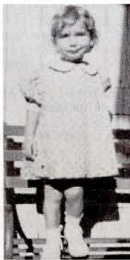
HEIR TO COFFEE FORTUNE?