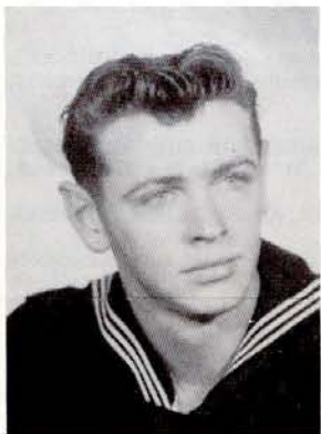
WORLD RULING SEA DOG