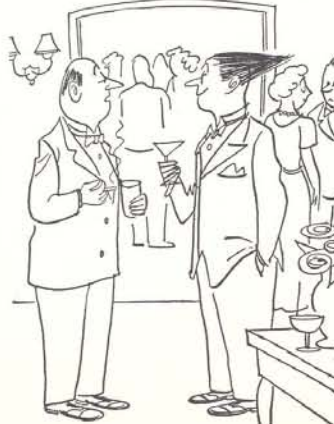
"Took your top down early this year, didn't you?"

Contributions must be in the Editor's office by the 15th in order to be printed in that month.